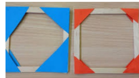
Reinforcing corners and shapes